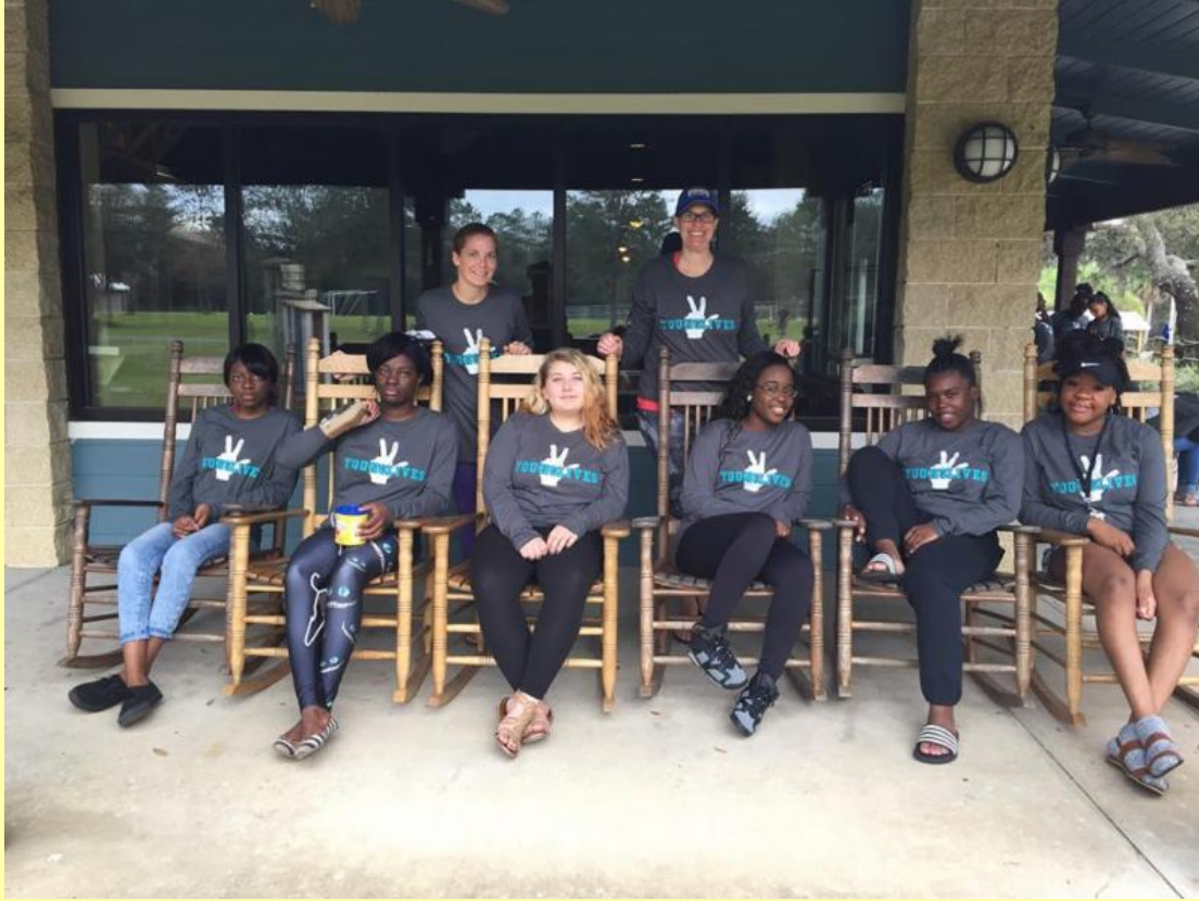
Young Lives StA Group