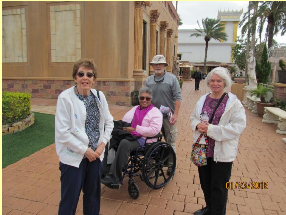
A group from our church joined with others on a deluxe motor coach trip to Orlando to enjoy the sights and sounds of the Holy Land.