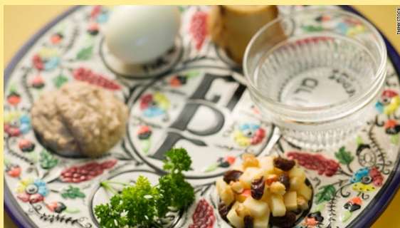
Each of these items will be served and their meaning explained