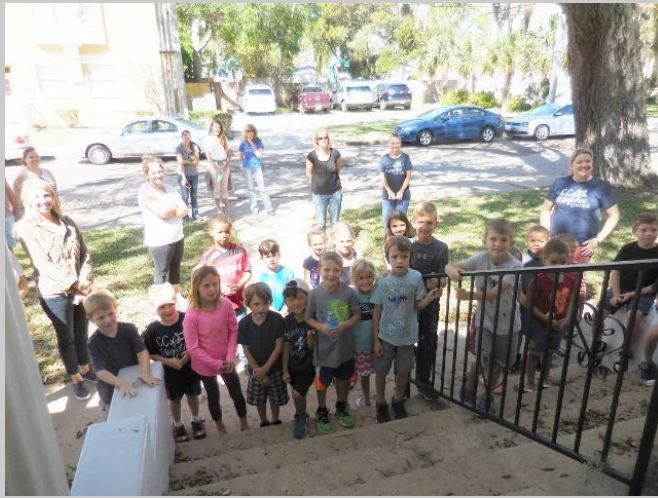
A representative group came to the church office to thank us for hosting them this year.