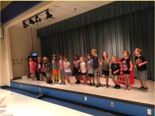
Webster students thanking the volunteers in song