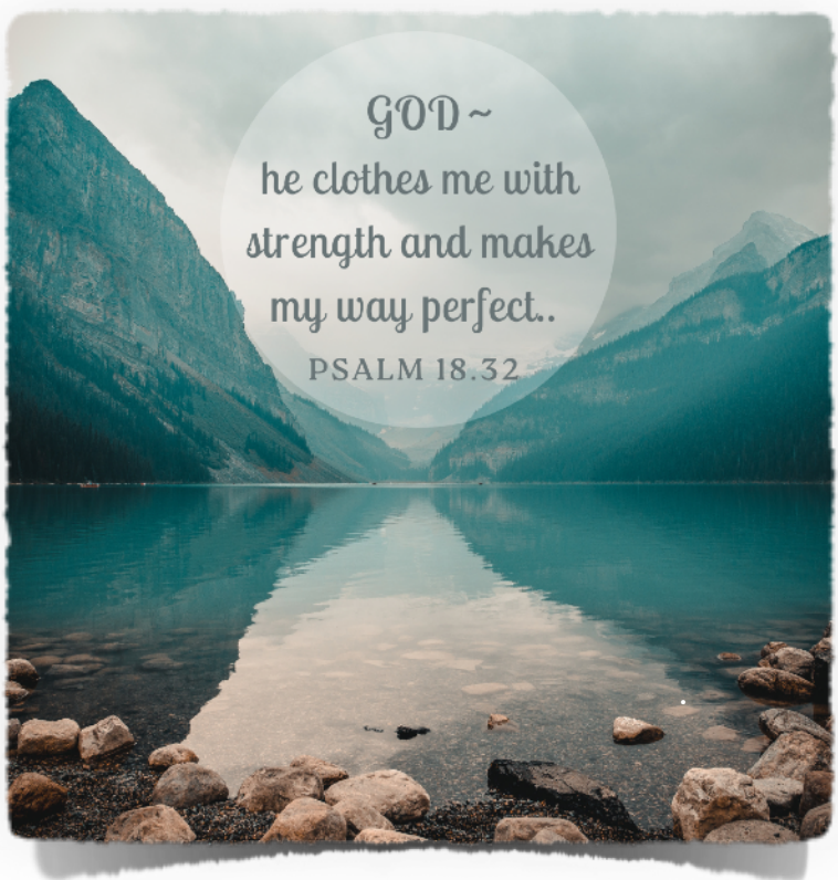
Sunday, October 23, 2022

Pursuing Life in Christ with Passion and Purpose!