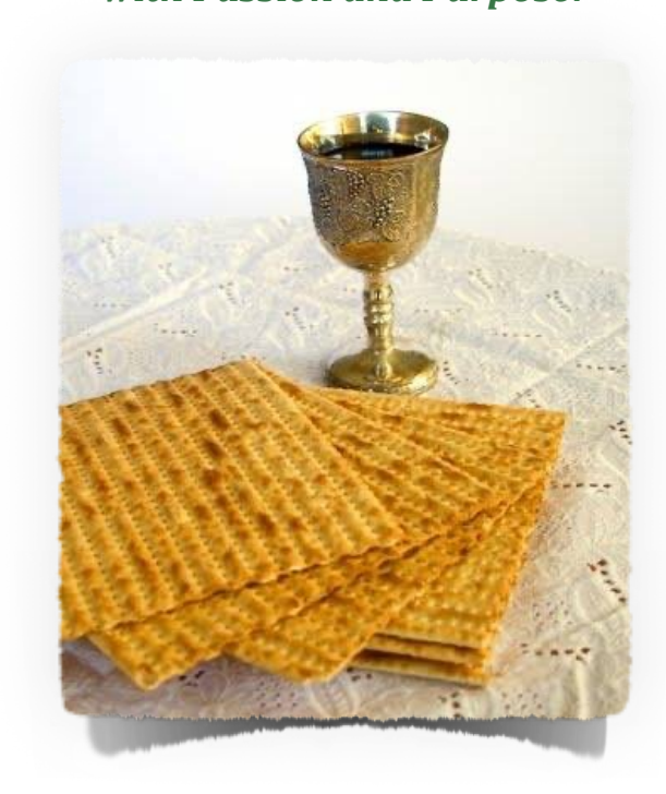
"Do This In Remembrance of Me"